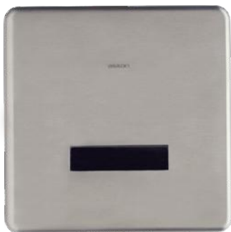
AS 07-IR (E) / AS 07-IR (B)