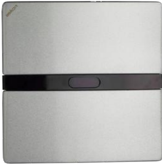
AS 05-IR (E) / AS 05-IR (B)