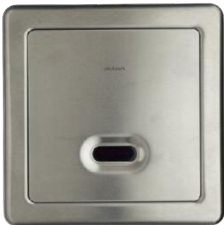
AS 06-IR (E) / AS 06-IR (B)